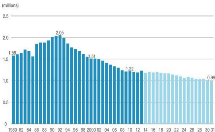
Figure 1 Japan's Population of 18-Year-Olds, 1980–2031