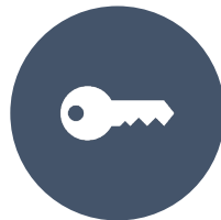
KEY: PLAN ACTIVITIES IN BLOCKS OF 15-20 MIN MAX.