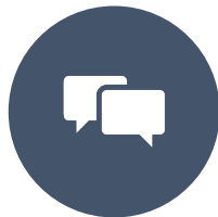
WHOLE GROUP DISCUSSIONS